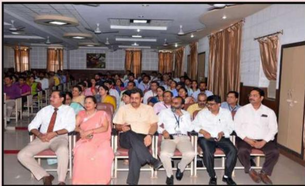
Faculty members attending the orientation during Session 1

SWAMI VIVEKANAND SUBHARTI UNIVERSITY, MEERUT