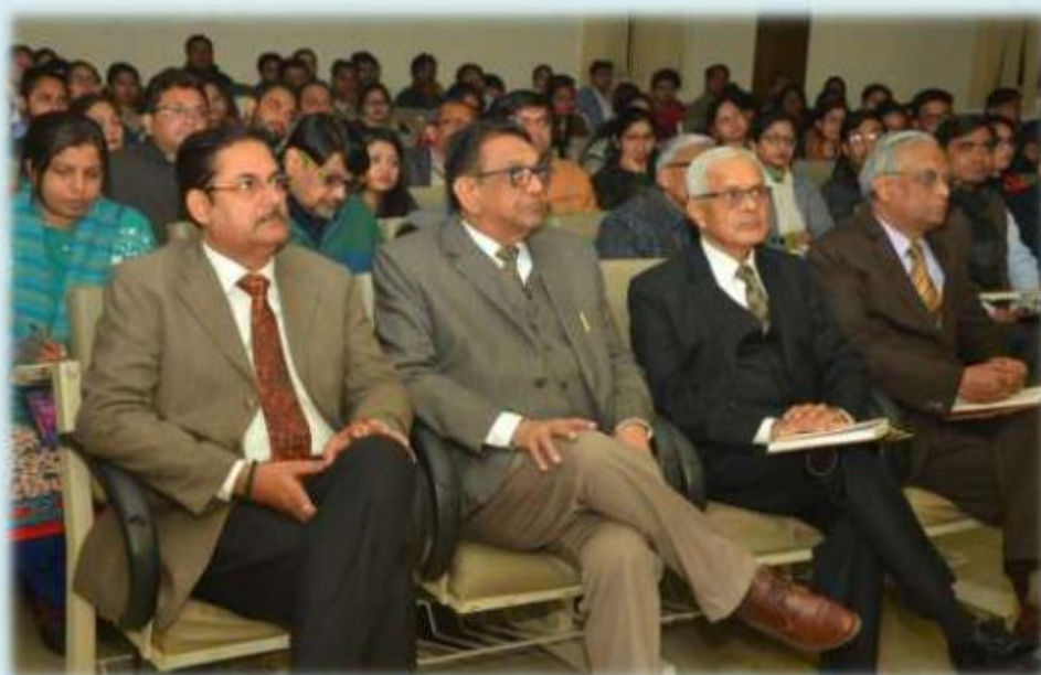
Participants of Workshop on Intellectual Property Rights (IPRs)