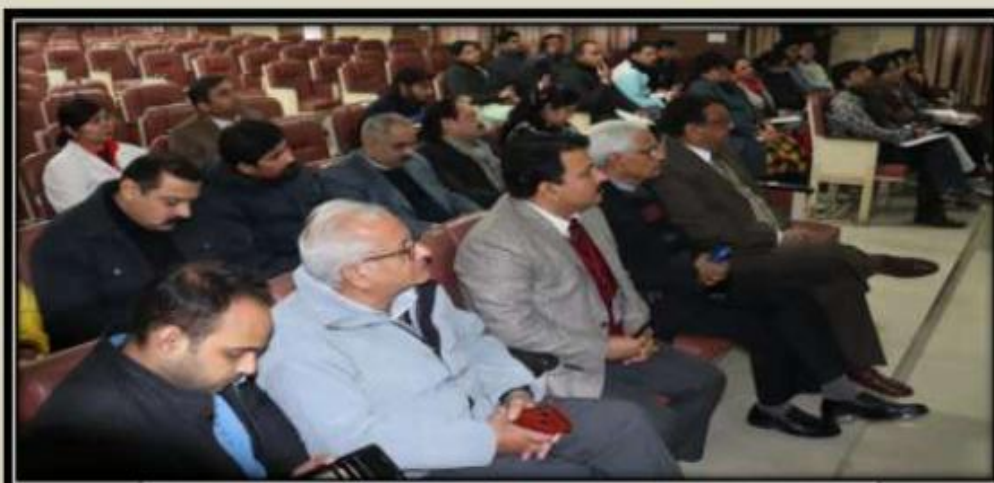
Faculty Members as participants in online Workshop

The workshop included live demonstration of online accreditation analytics based on the NAAC. The session was followed by the queries of the participants from the experts of KARMA Solutions.