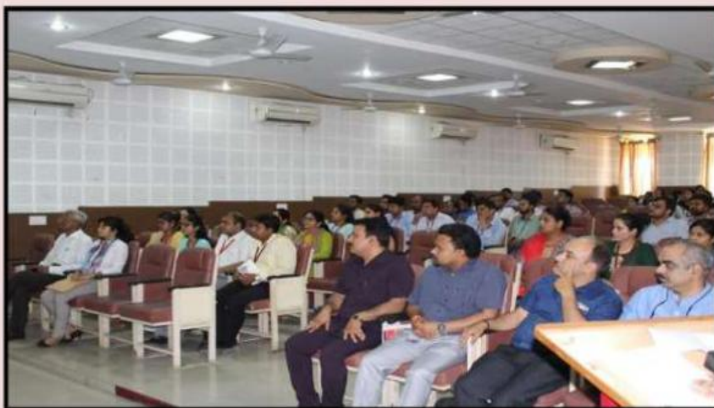
Faculty members attending the orientation during Session 2