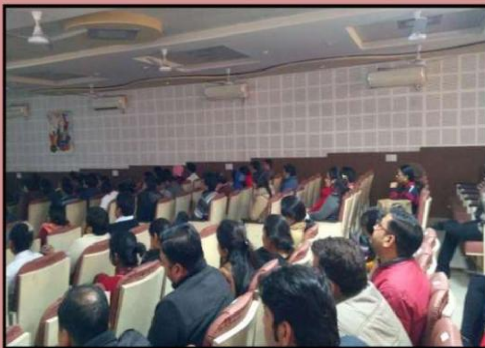
Faculty members attending the Orientation Seminar