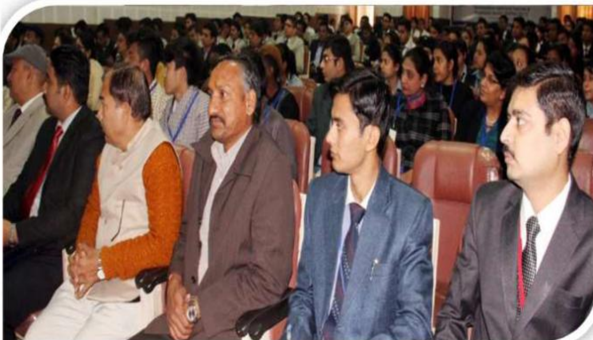
Faculty orientation - Smart Board Technologies Training on 18/10/2019