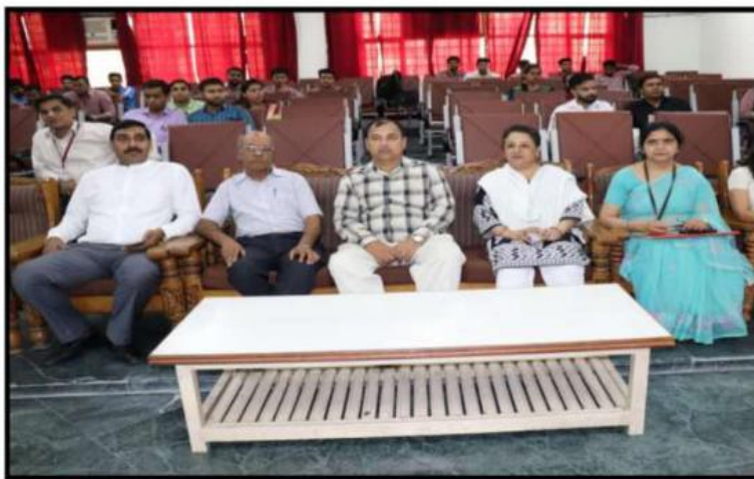
Speakers and the Participants of the Workshop