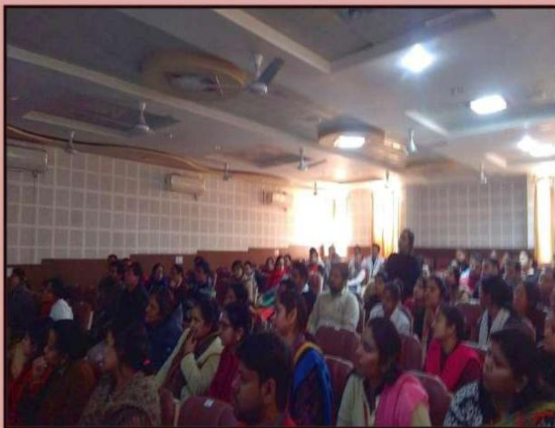
Discussion Session during the Orientation Seminar

9. Bill and Melinda Gates Foundation (Website: www.gatesfoundation.org )