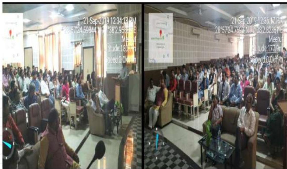
Faculty Members and Research Scholars attending Guest Lecture