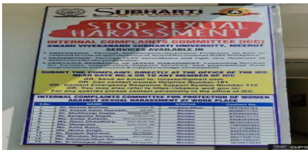
Constitution of Internal Complaints Committee (ICC)

Weblink: https://subharti.org/icc-subharti-university-india.php