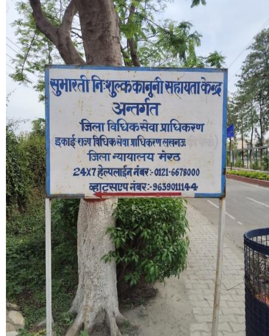
Legal Aid and Grievance Redressal Support System at Subharti Law College