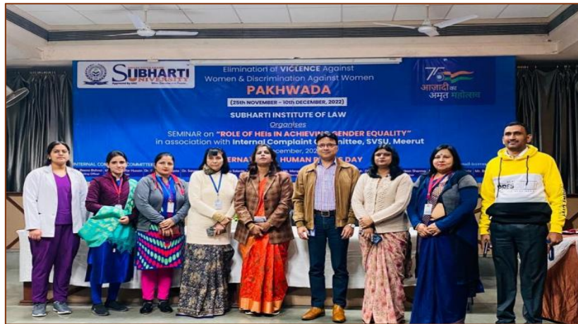
Seminar organized by Internal Complaints Committee (ICC)