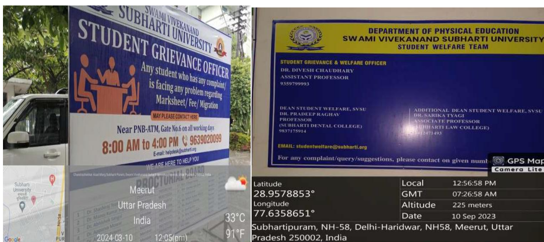
Site of Grievance Office

The Student Grievance and Redressal Committee at Swami Vivekanand Subharti University was established to address students' academic, administrative, and personal concerns in a fair and transparent manner. The committee provides a systematic approach for students to express their grievances and seek timely resolutions while ensuring impartiality and confidentiality. By promoting student welfare, effectively resolving conflicts, and fostering trust between students and the university administration, it aims to maintain a positive academic environment.