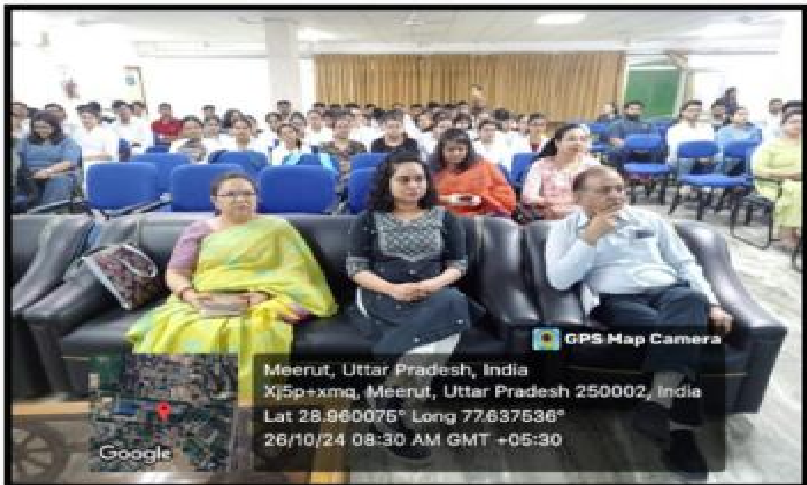
Figure 2: Faculty, PGs, Interns attending CME