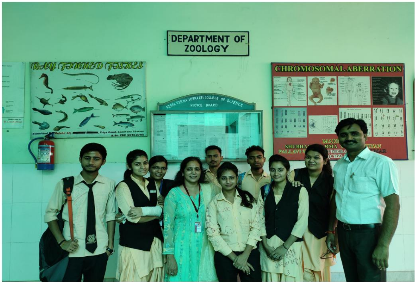
Participants of value Added course