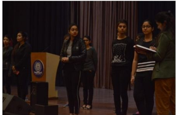
Students participating during value added course