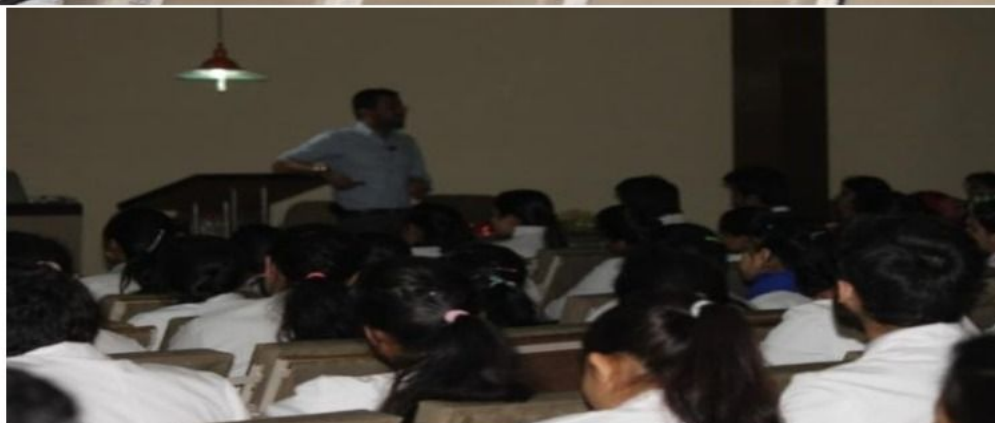
Participants of Value Added Course