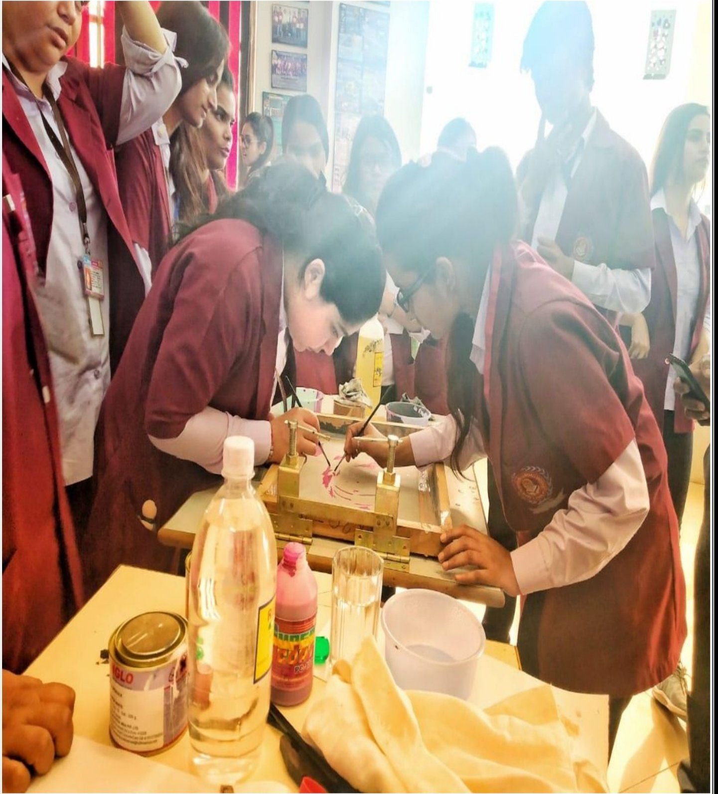
Skill enhancement of Students under VAC