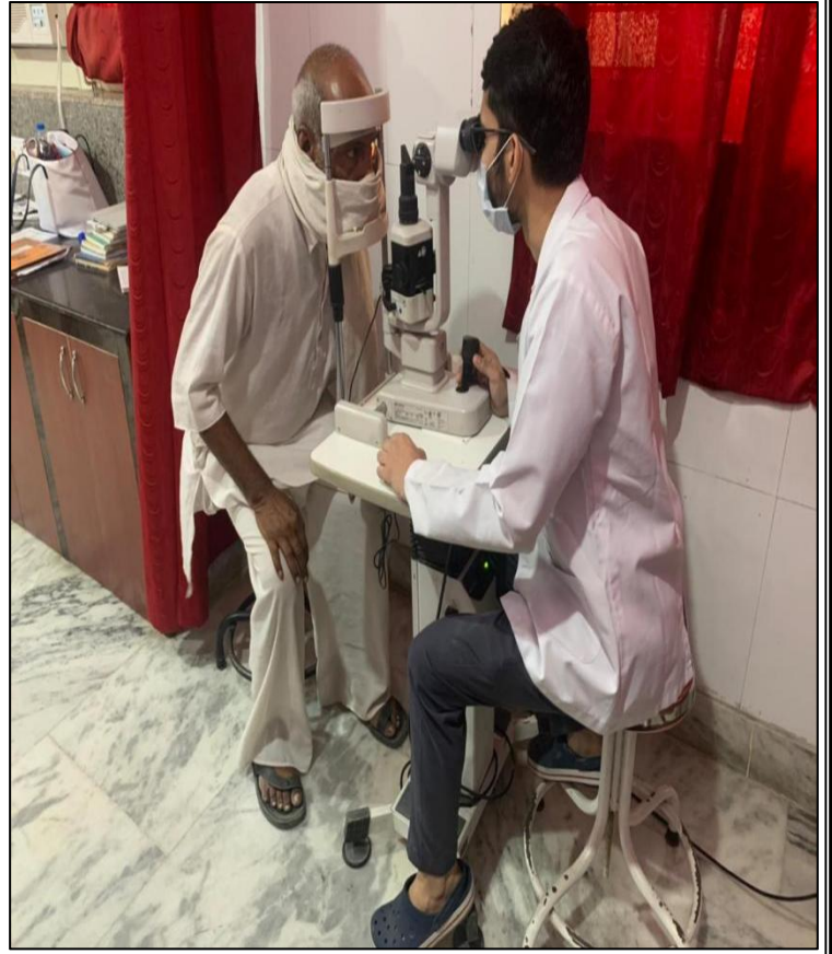
USING NON CONTACT TONOMETRY(NCT)USING SLIT LAMP