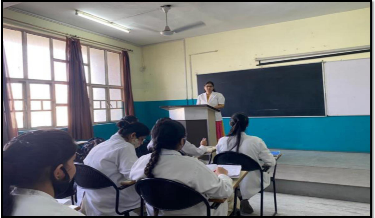
VAC: Augmentative and Alternative Communication