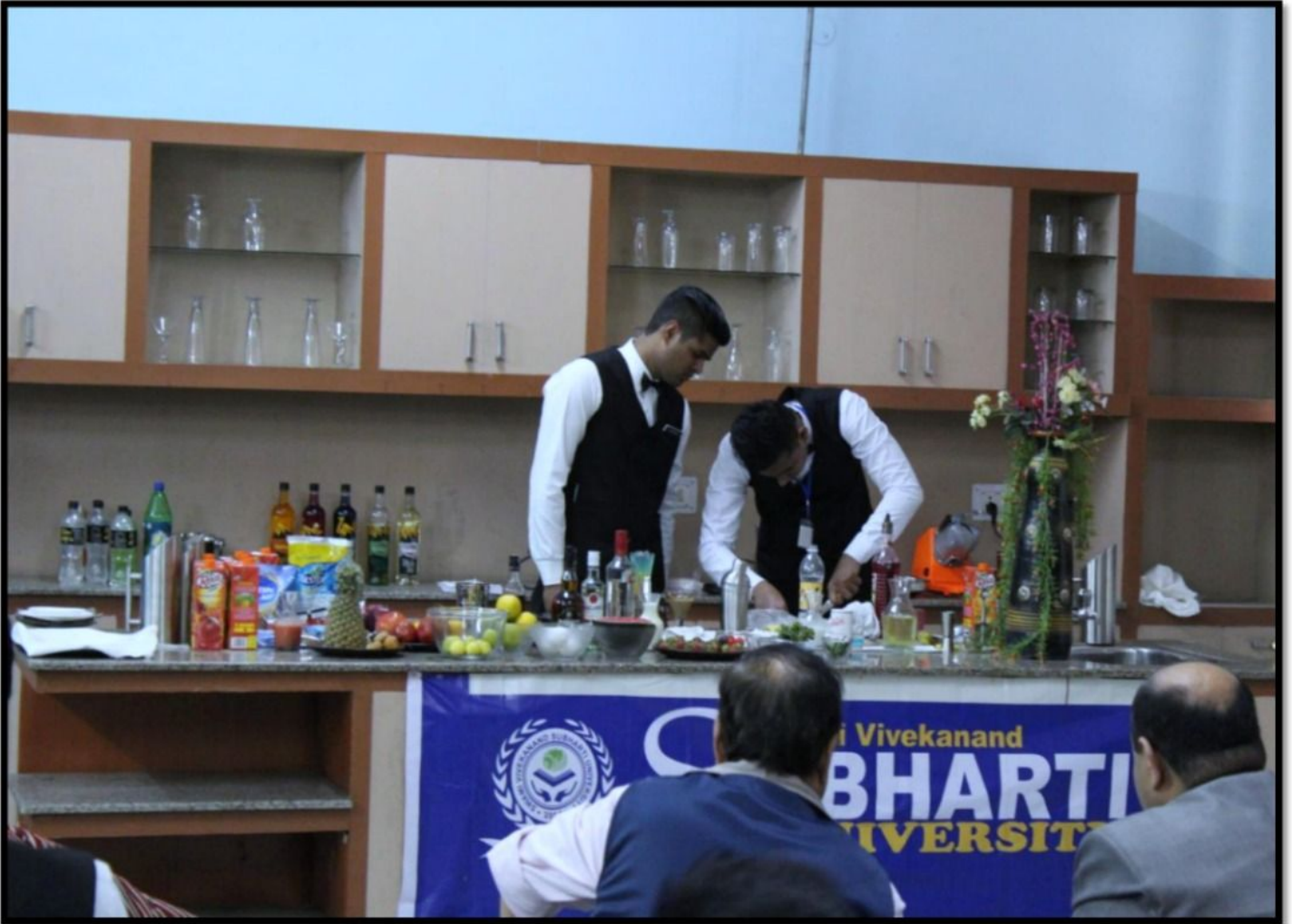
Students practicing during value added course