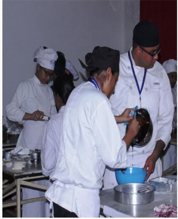
Students training during Value added course