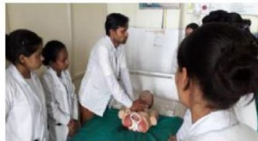
Figure 1: Demonstration on CPR