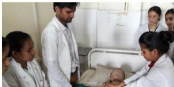
Figure 3: Return Demonstration of CPR