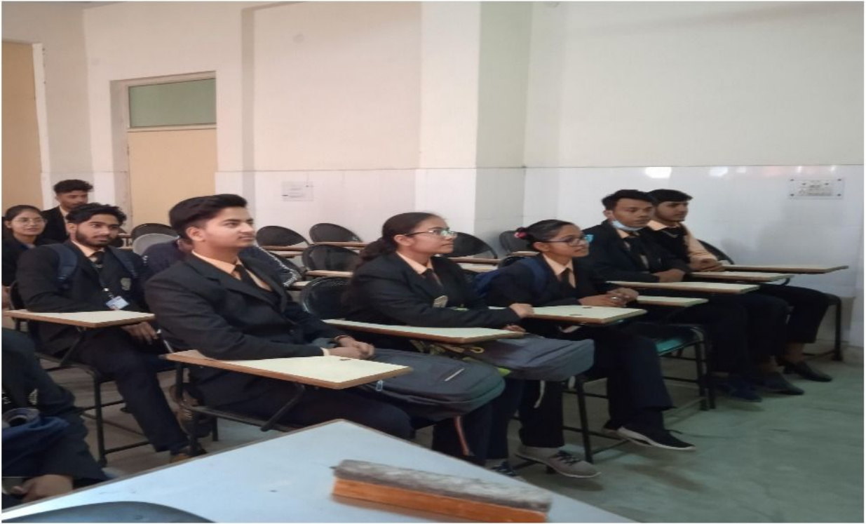
Students attending Value Added course