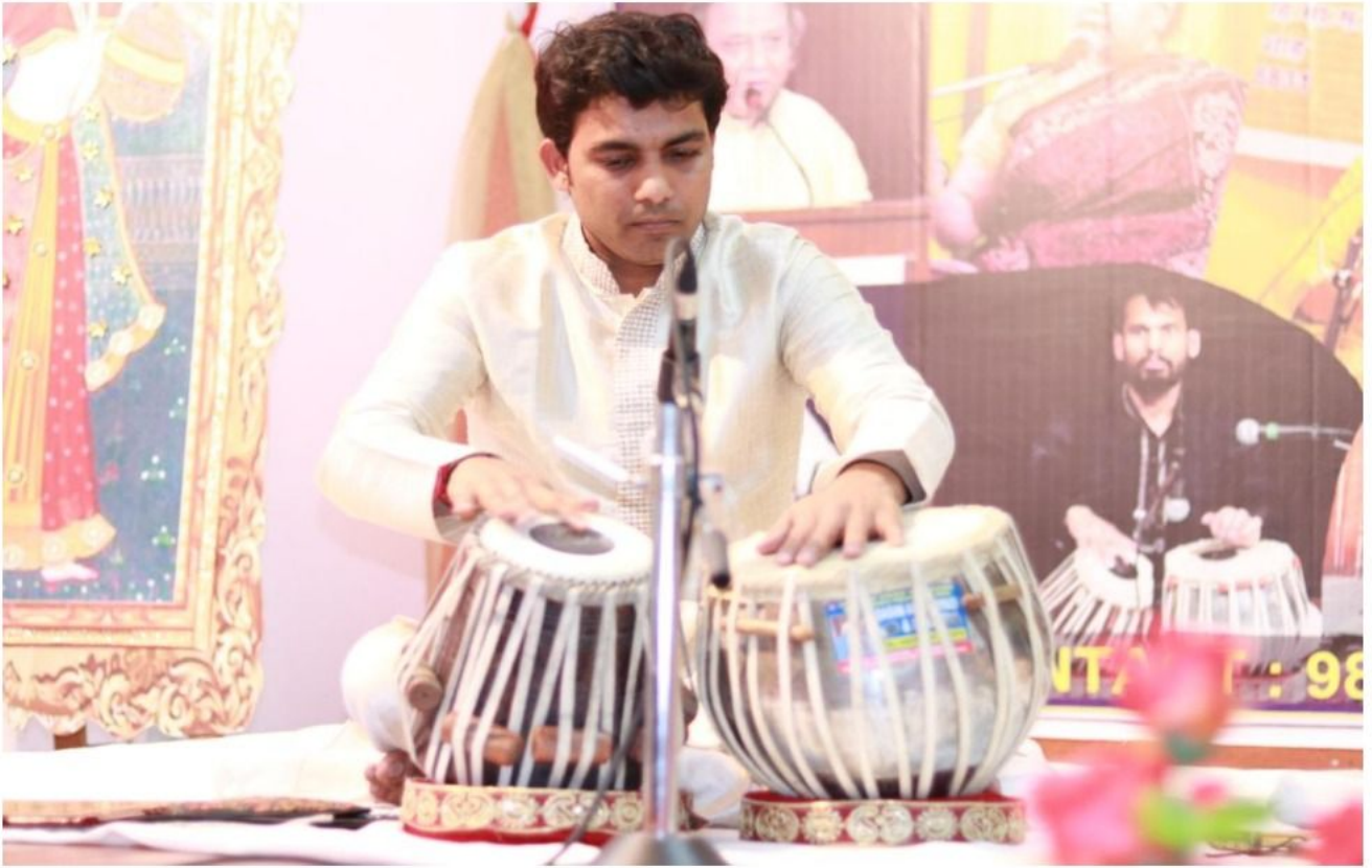
Student participating during value added course