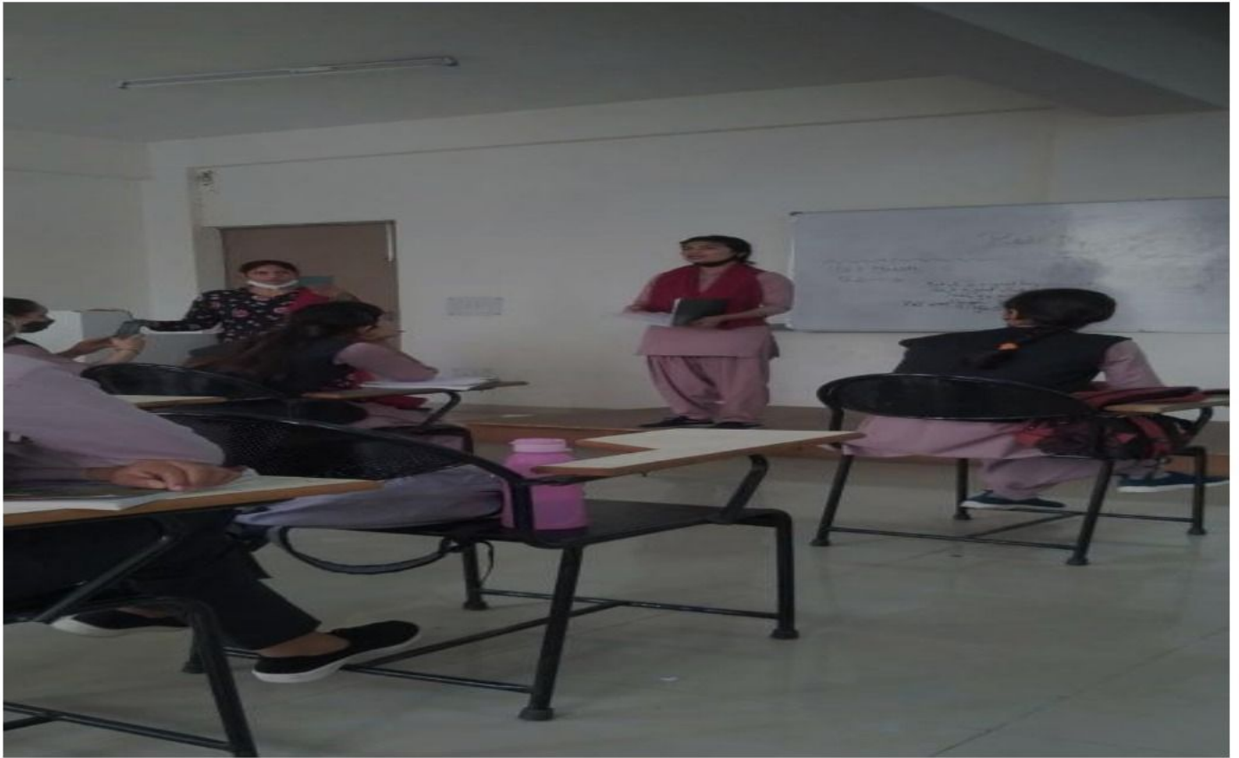
Student giving demonstration during value added course