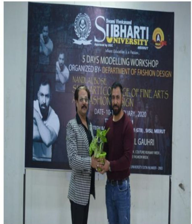
Students Participating during Value added course