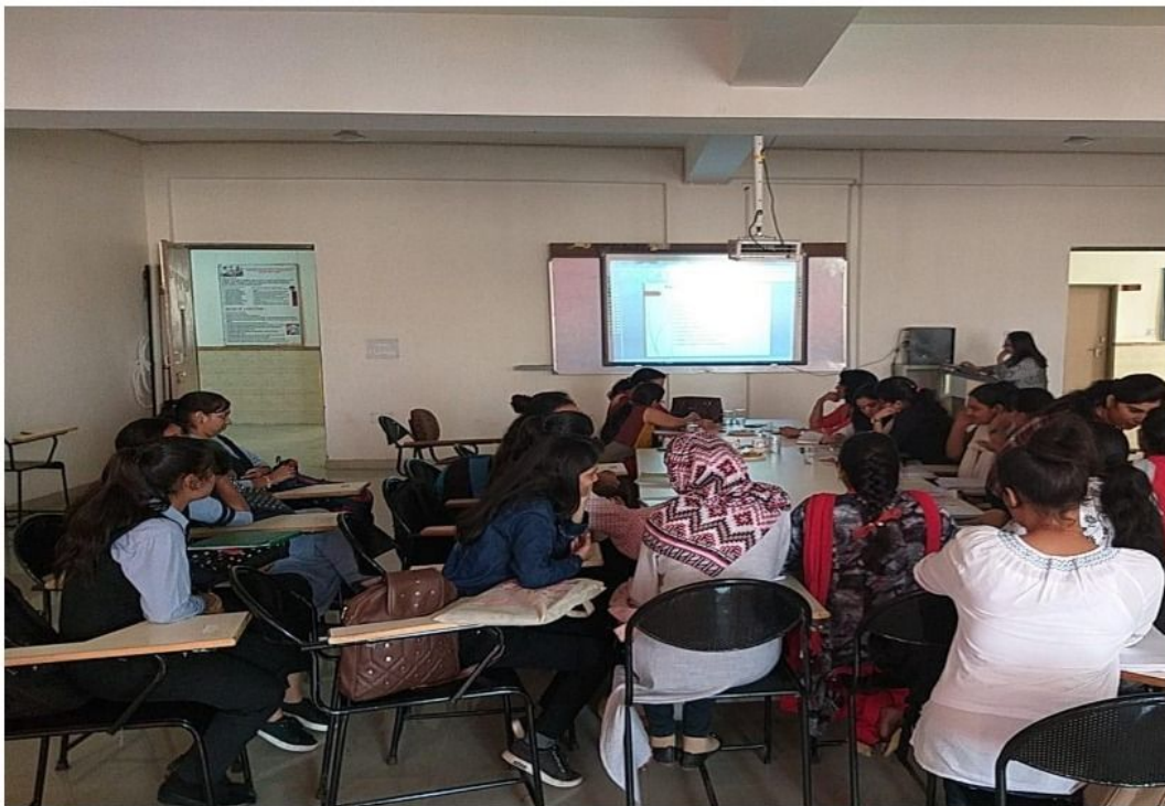
Students participating during Value Added Course

A handwritten signature in black ink, appearing to read 'Jyoti Gaur', written in a cursive style.