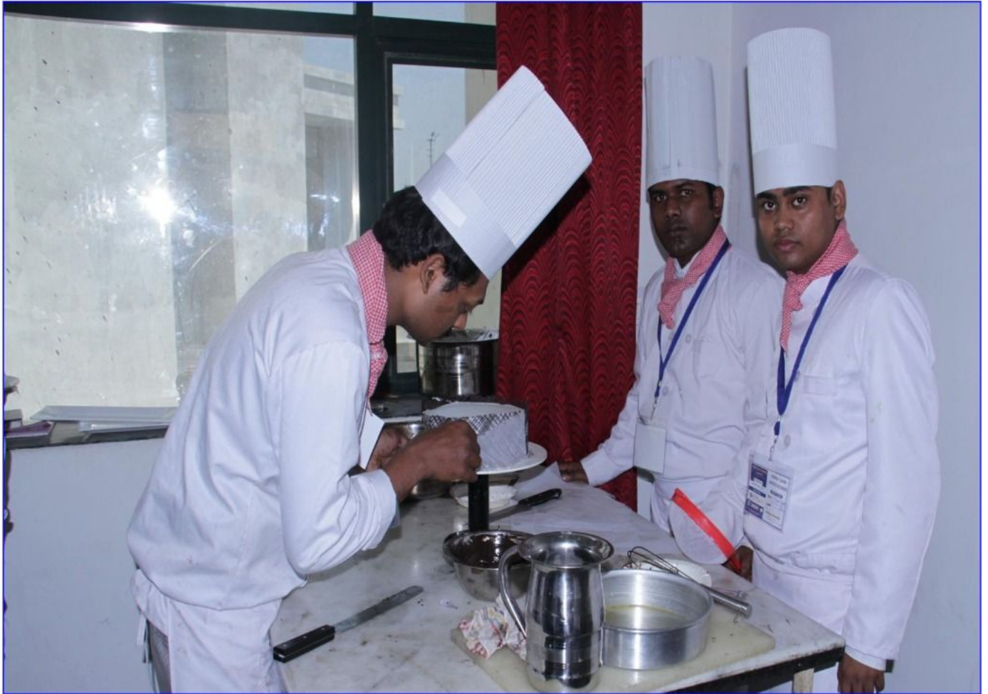
Hands on Training during value added course