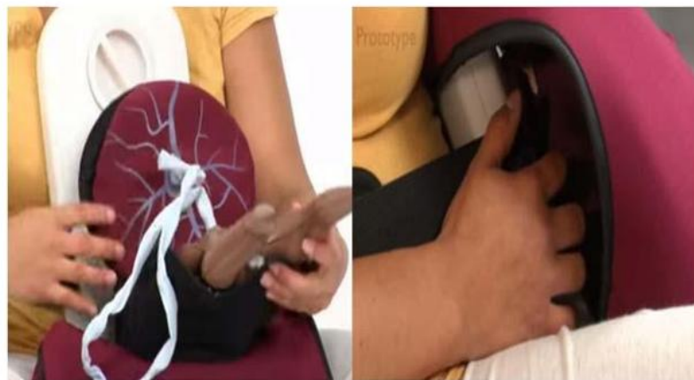
Connecting placenta and tapping the body for FHR monitoring