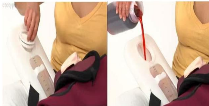
Filling of Red blood simulator in the blood tank