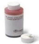
Red simulated Blood

The operator/trainer (who takes the role of the pregnant woman) then straps the mannequin around his/her waist and manually controls the delivery training scenario