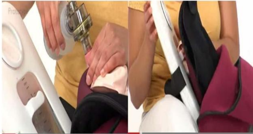
Inflating the uterine set and clamping it with the bone set preparation