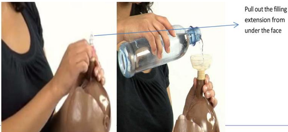
Opening the valve and filling NeoNatalie with water

Fit the hard skull with fontanelles onto NeoNatalie's head: Fold the sides of the hard skull upwards. Place the skull with the triangular frontal fontanel on the forehead.