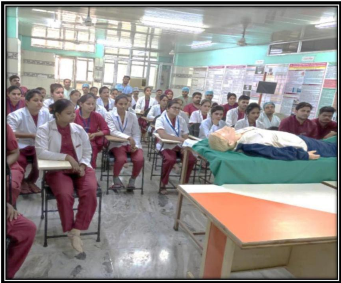
Students attending BLS training

BLS training is organized by Subharti Medical College every month for the students who ever is willing to take part in this value-added course. A total of 16 hours training is given over a period of 2 days from 9 am to 5 pm. Venue of training is Medical Council Hall, SMC. This training has helped the participants to gain knowledge and hands on training regarding various aspects of Basic Life Support. After the completion of the course, a post test is taken and whoever obtains a passing mark is provided with a certificate.