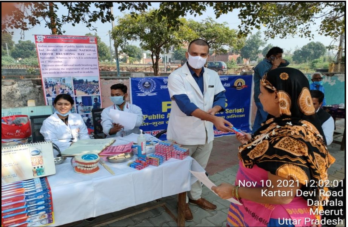
(Oral hygiene instructions for patients at Daurala)