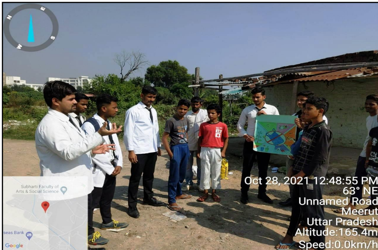
(Students showing a poster to explain the problem associated with single use plastic)