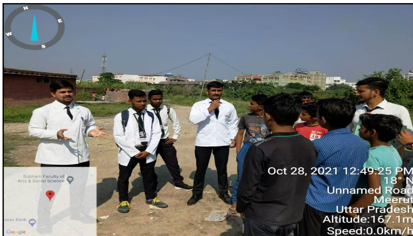
(Students in community, spreading awareness for single use plastics)