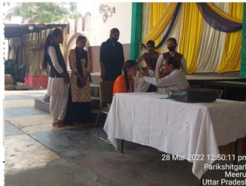
28 Mar 2022 12:50:11 pm Parikshitgarh Meerut Uttar Pradesh