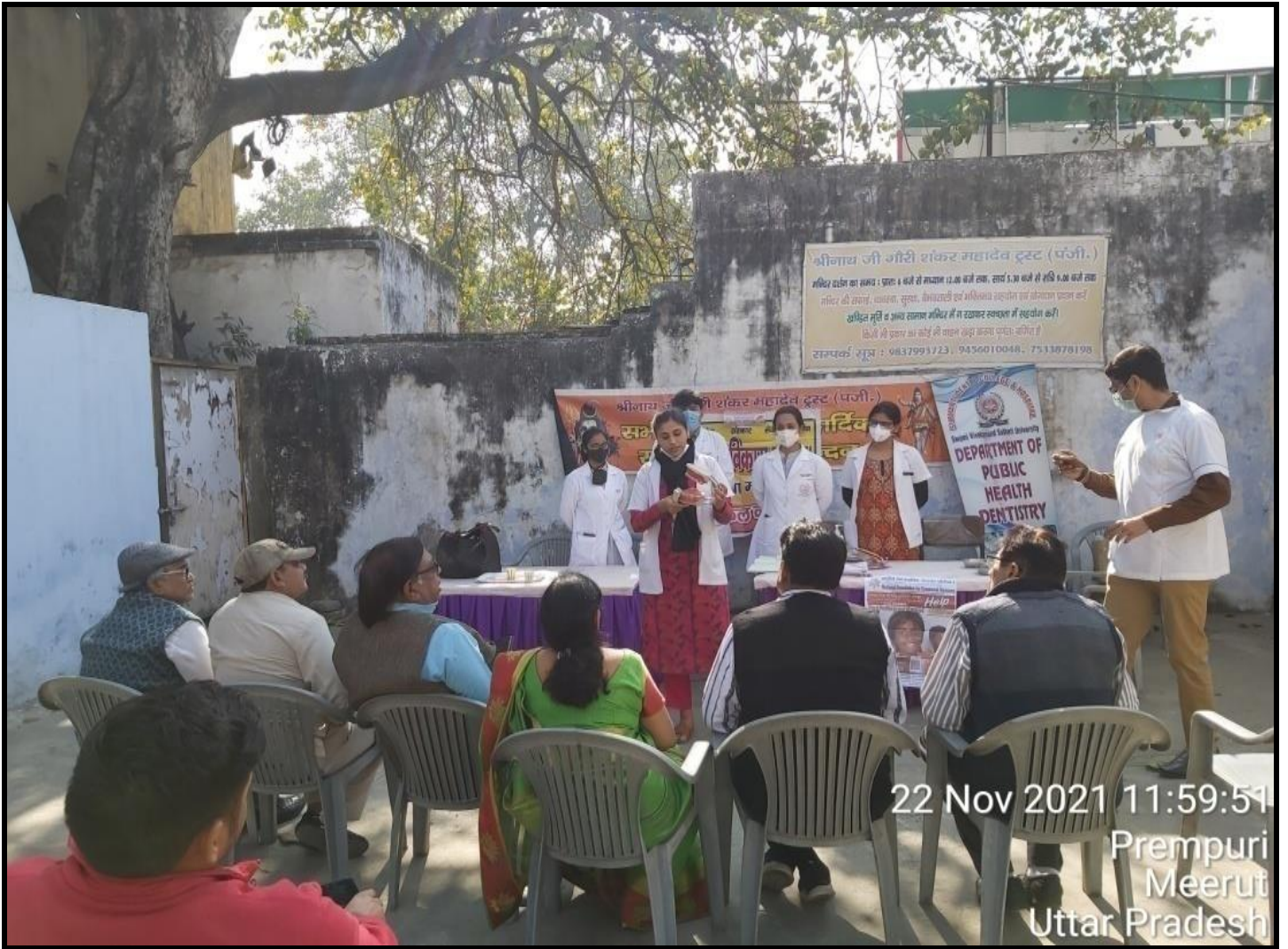
(Oral hygiene instructions for patients)