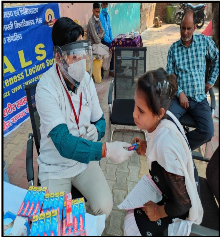
(Toothpaste distribution at Daurala)