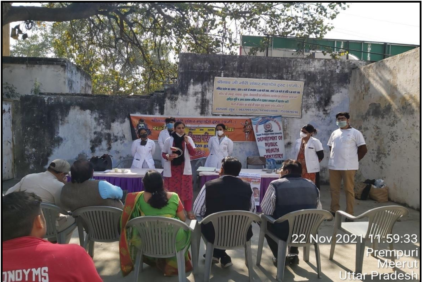
(Oral hygiene instructions for patients at Daurala)